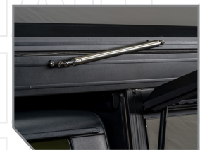
HEAVY-DUTY OPEN ASSIST GAS STRUTS