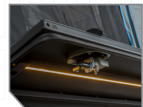
INTEGRATED LED LIGHT PACKAGE