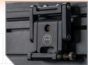
AIRCRAFT ALUMINUM FEATURES